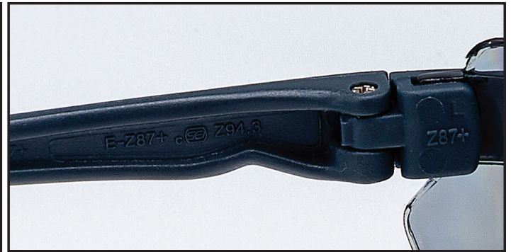
Third Party Certified